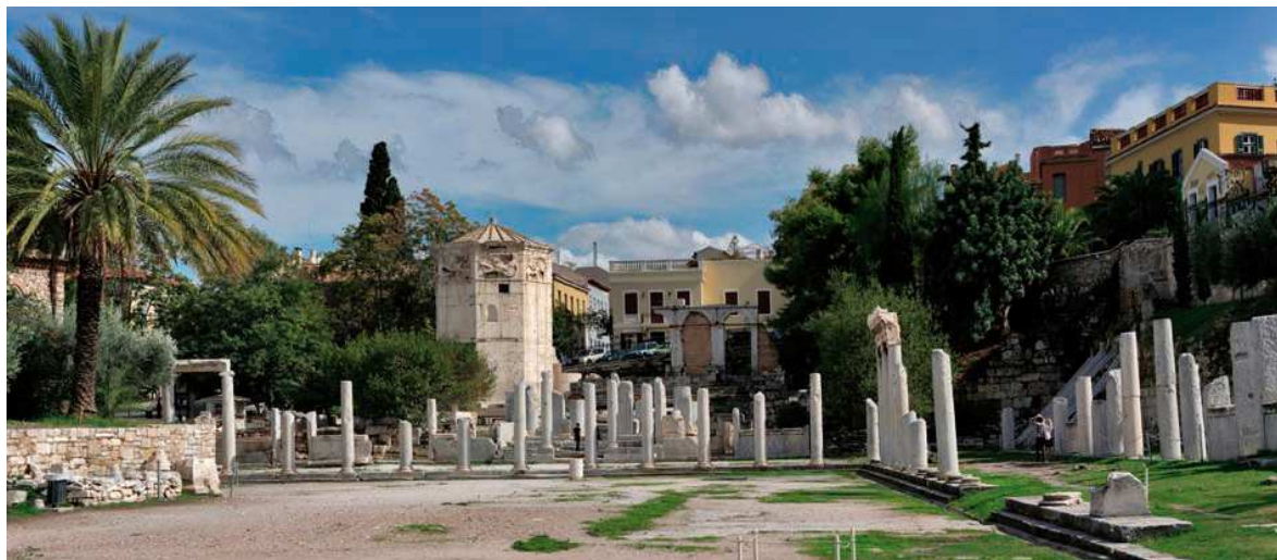
The Webster University Cultural Center in Plaka

Further, prestigious accreditation bodies in their respective fields accredit the various schools/departments of the University.